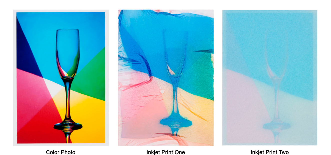
Figure 1 Color photograph and two inkjet prints after 48 hours immersion.

The author would like to thank the Institute of Museum and Library Services for providing funding for the project. In addition, many Image Permanence Institute staff, interns, and student